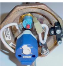
Dual cut-out safety protection